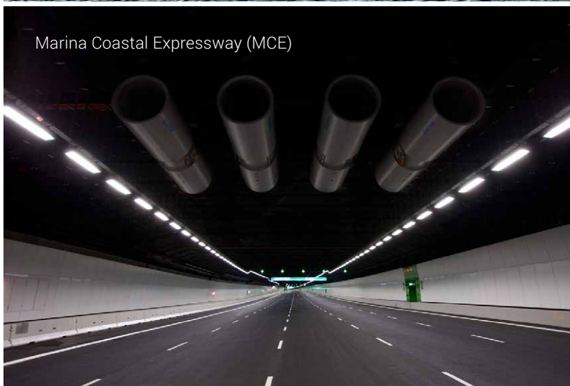
Marina Coastal Expressway (MCE)